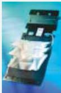
Lumbar and lateral supports